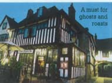
A must for ghosts and roasts

building on a cobbled street in Rye, East Sussex. Its beamed, panelled rooms are rumoured to be haunted, although it's not so much a favourite of smugglers, as snugglers these days. The delicious food won't leave your wallet groaning, and you can walk it all off on the beautiful Camber Sands. Feel-great factor: Sunday lunch costs £21 for two courses, or £25 for three. A double room costs from £150 per night (Mermaidinn.com; 01797 223065).