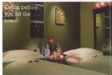
Detox before you hit the town!