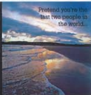
Pretend you're the last two people in the world...

Acres of white sand, wild surf and solitude. No, not Hawaii, this is Inchydoney Island, 30 miles west of Cork, and one of the most romantic places in the world. You can stroll hand in hand along the coastline gazing out across the ocean. Then warm up at the Inchydoney Island Lodge and Spa over a candlelit dinner. Finish off with a drink and some Irish music at Clonakilty's De Barra pub.