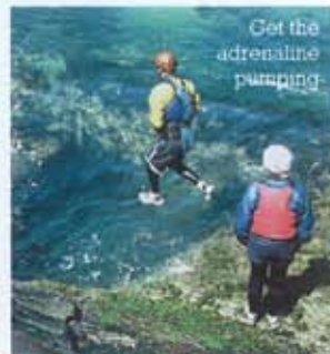
Get the adrenaline pumping

Feel-great factor: Shaggy Sheep Wales offers coastering for £40 for three hours, plus other activities (Shaggysheepwales.co.uk; 01559 363911). Stay at the TYF eco hotel in St David's, Pembrokeshire, from £35 per person B&B (Tyf.com; 01437 721678).