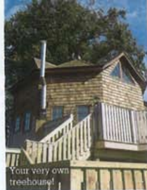
Your very own treehouse!

Feel-great factor: Book the Girlie Friday Night In offer at Malmaison-newcastle.com; 0845 365 4247.